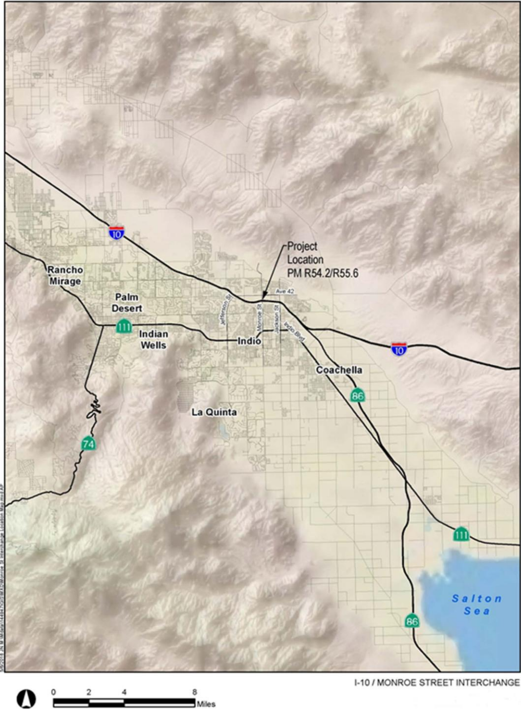
Figure 1 – Project Area